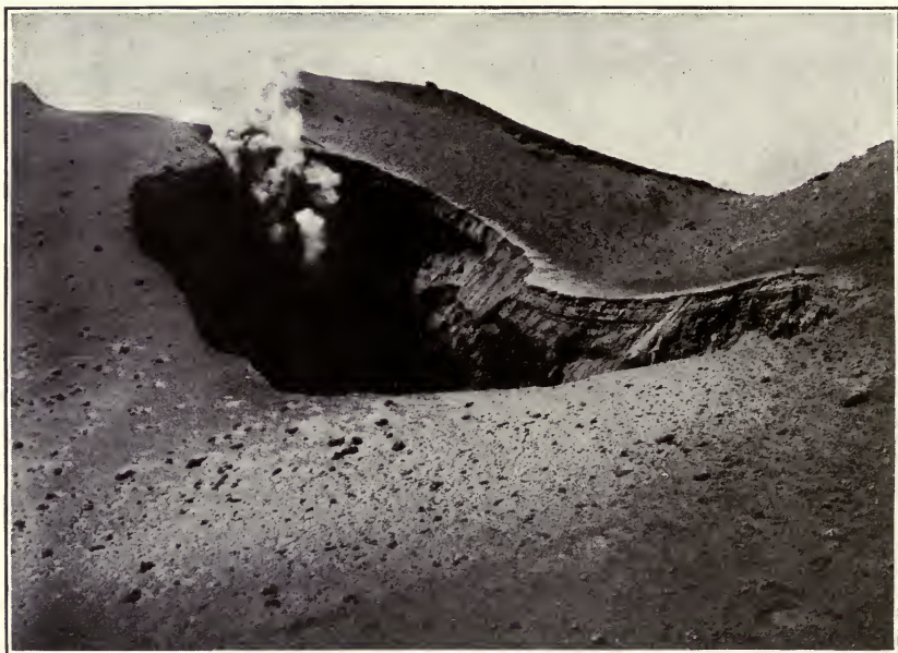
FIG. 4.—Looking northwest from the rim of the old crater across the new crater, August 17, 1914, after it had been enlarged by 25 eruptions. The sand and boulders ejected from the new crater cover all the slopes of the old crater in view and the deposits are stratified as seen on the inner slope of the new crater.

Prof. R. S. Holway, who was one of the first observers to ascend the mountain after the eruption, saw it on May 27, five days after